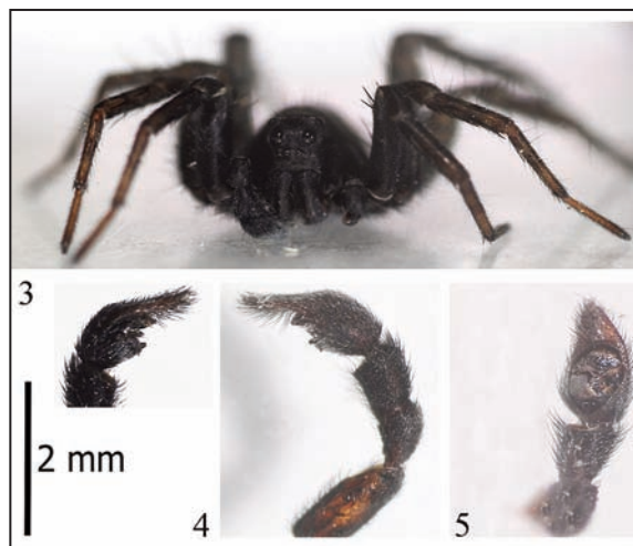
Figures 3–5. Aulononia albimana male frontal view (Fig. 3), palp lateral (Fig. 4), and frontal view (Fig. 5).

EXAMINED MATERIAL. Sicily (Italy), Palermo, Pioppo, Bosco di Casaboli, 38°04'01.0"N